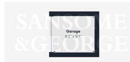
Floor 0 Building 3