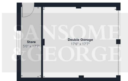
Floor 0 Building 3