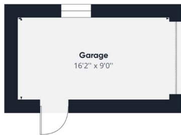
Floor 0 Building 2